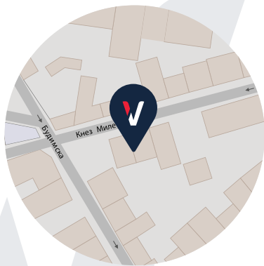
📍 Health center "Vizim" – Centre Knez Miletina 36 11000 Belgrade